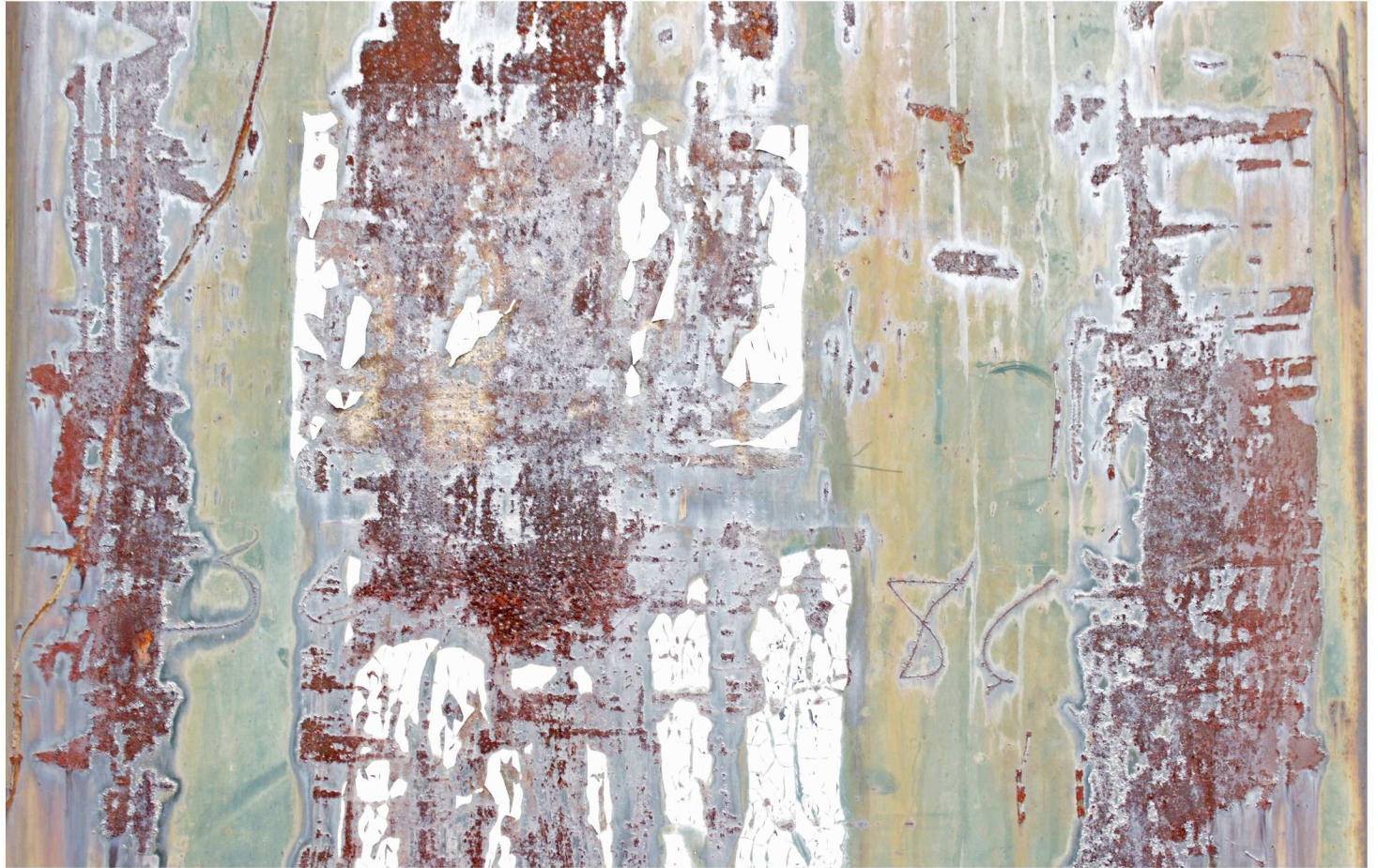
Inside photo: Odita Cover by: Gale