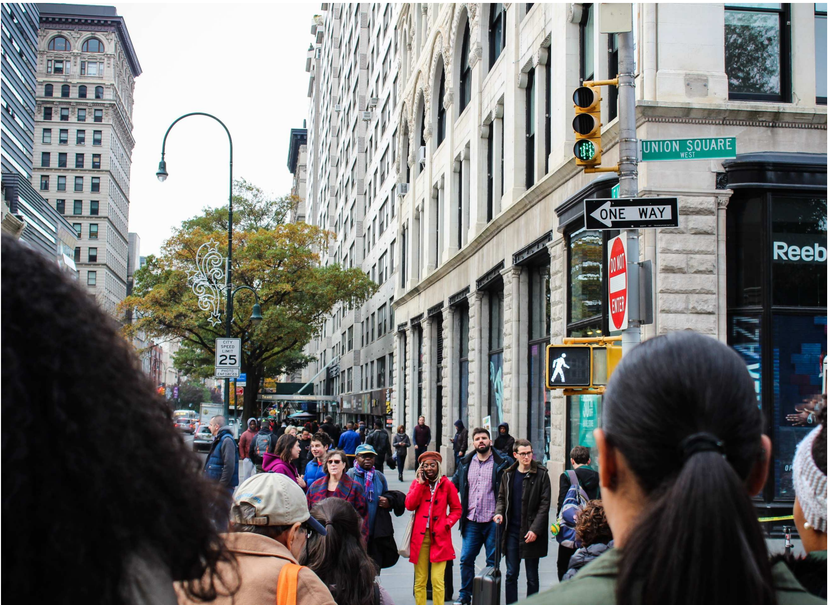
"Union Square" by Cesia Arzu