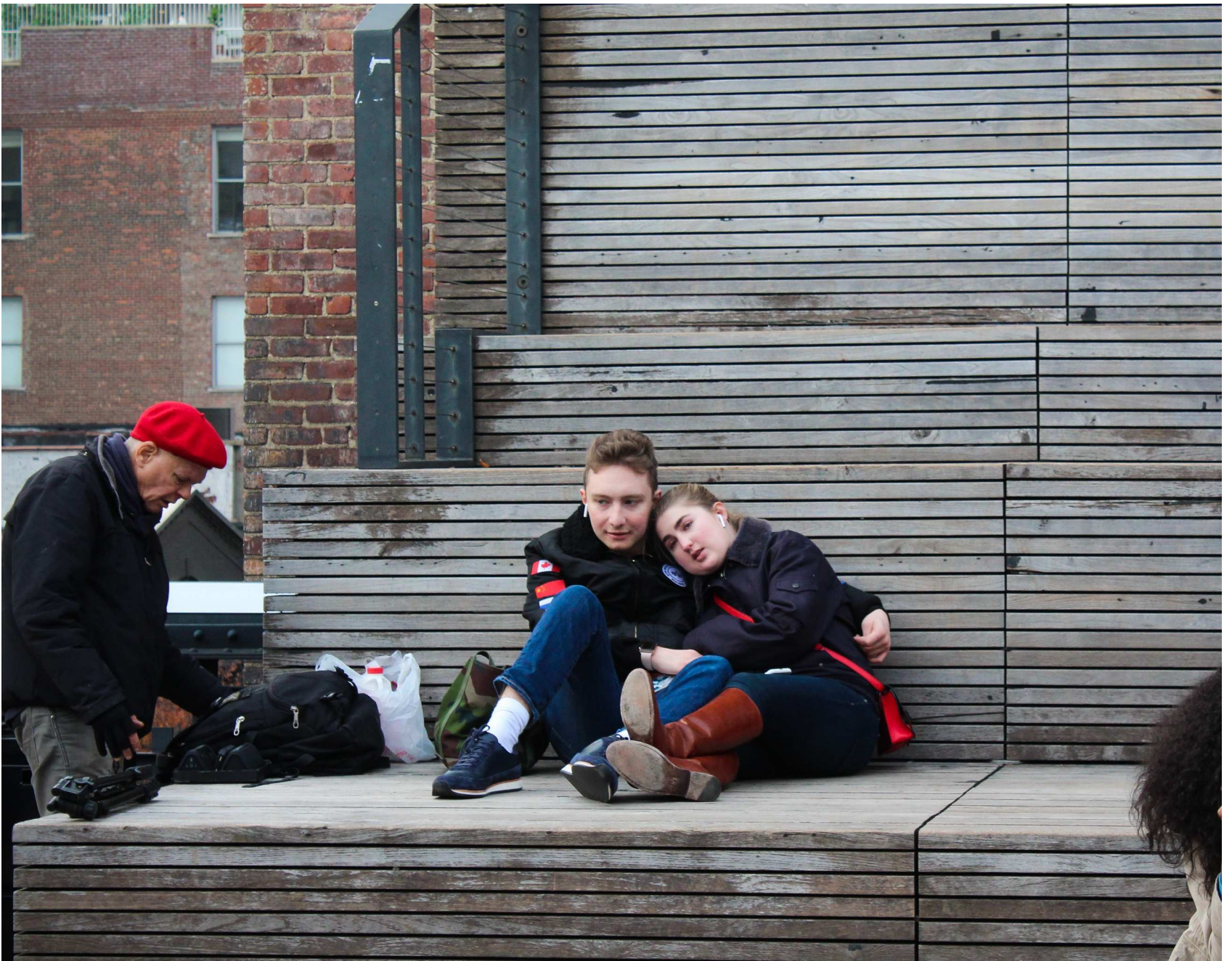
"Abstract Distraction" by Horace Shelton