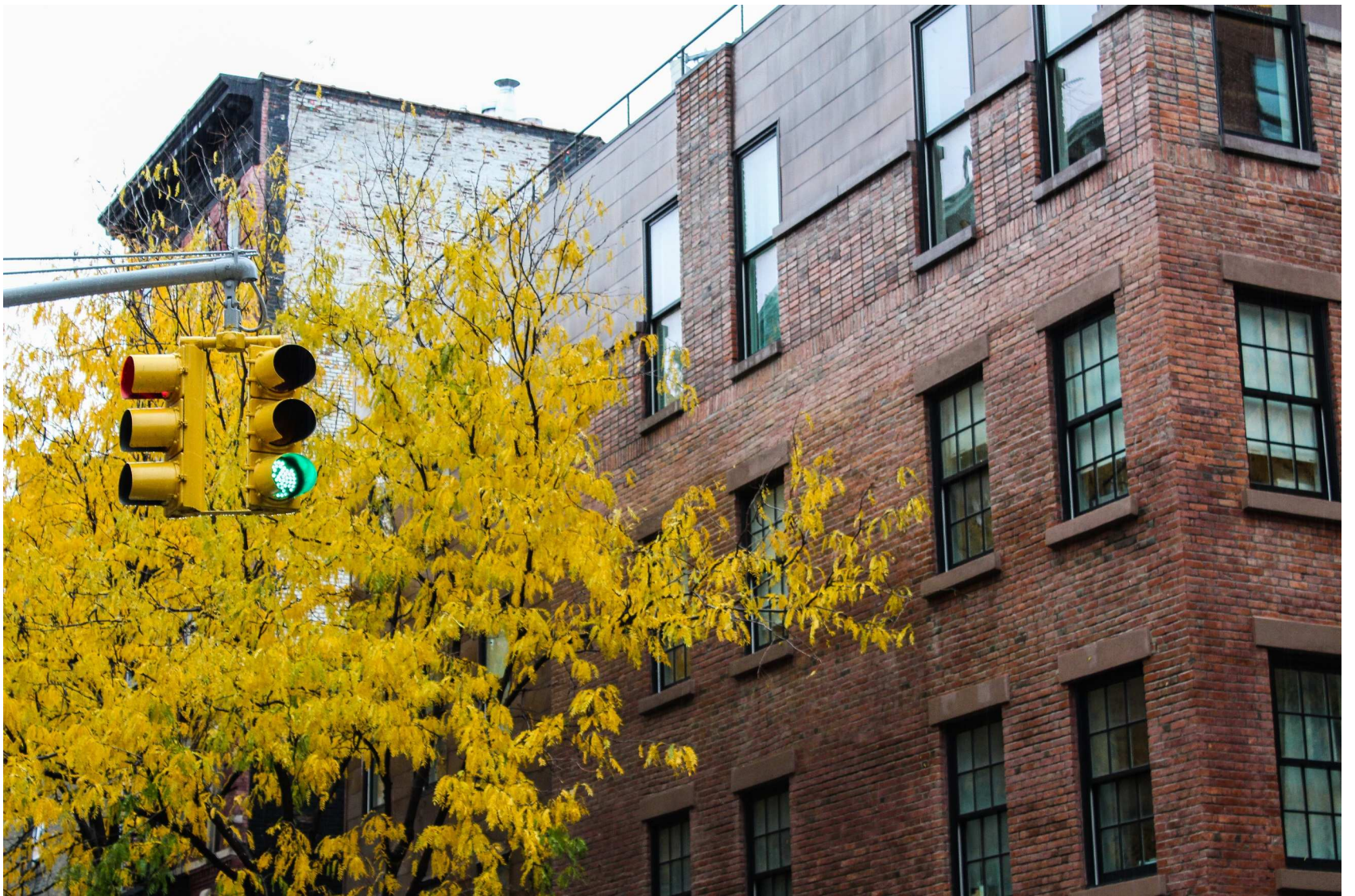
"Color of Life" by Galay Moran ( above and right )