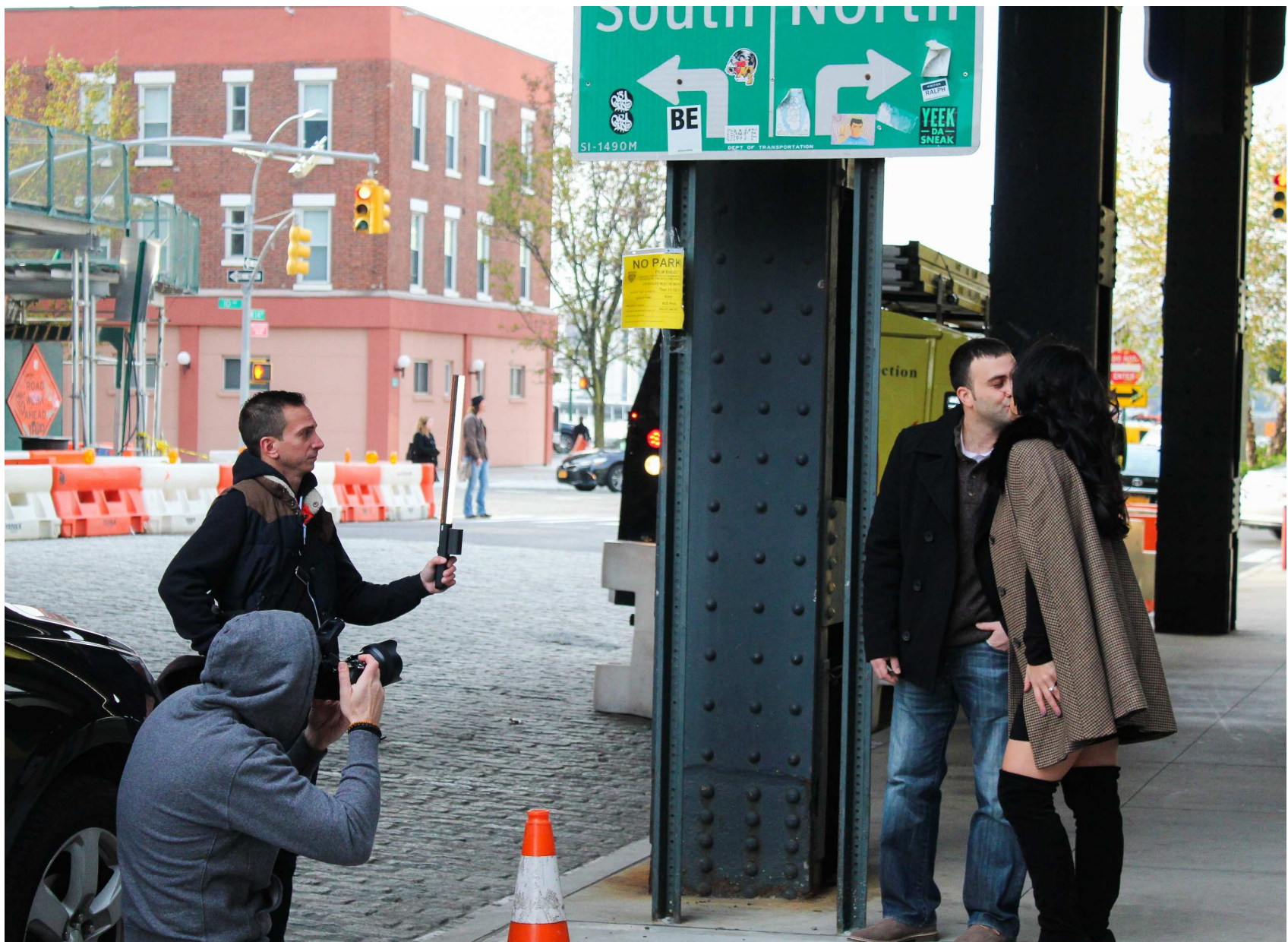
"Happy Ending" by Horace Shelton