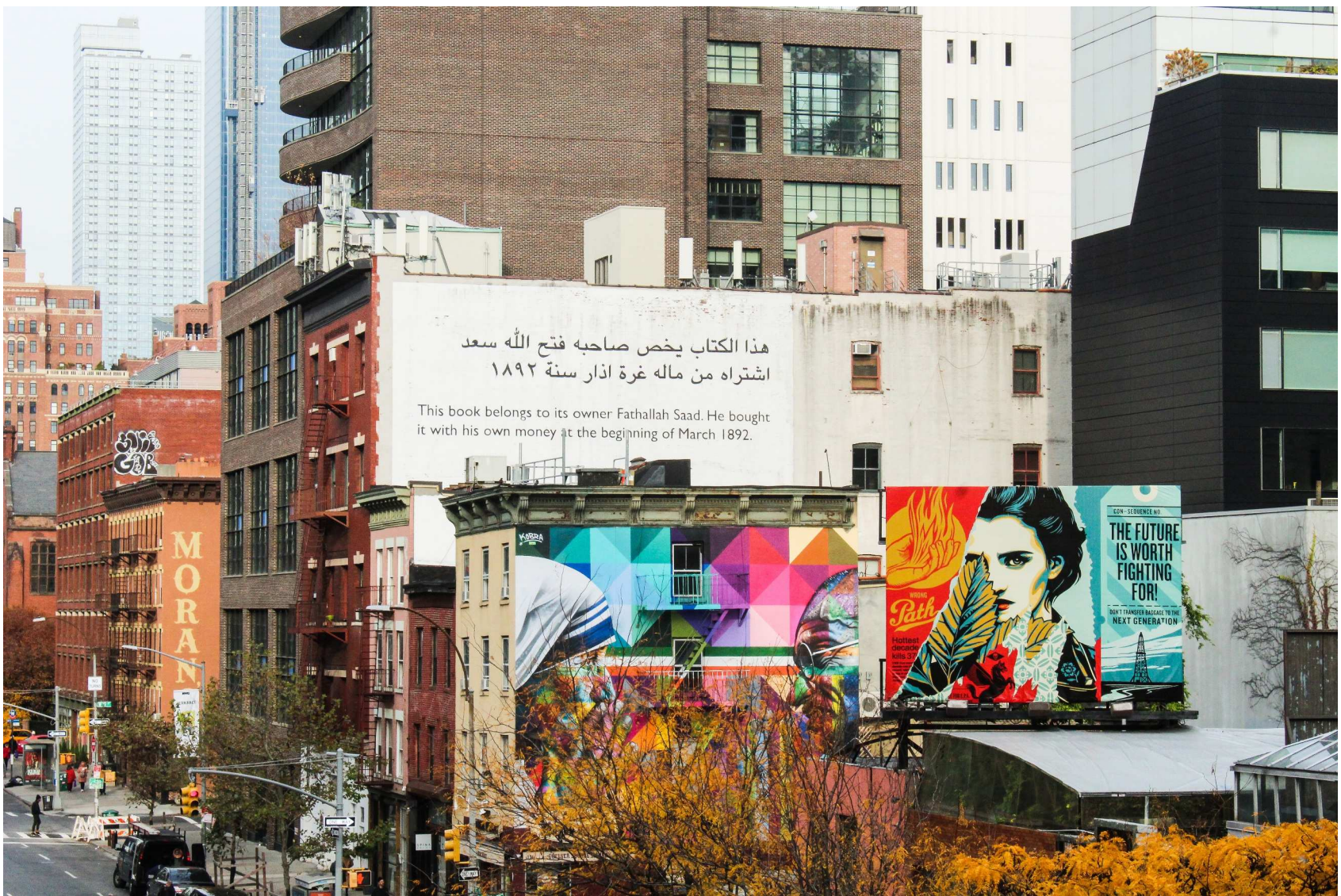
"Middle East" by Amna Khan ( above )