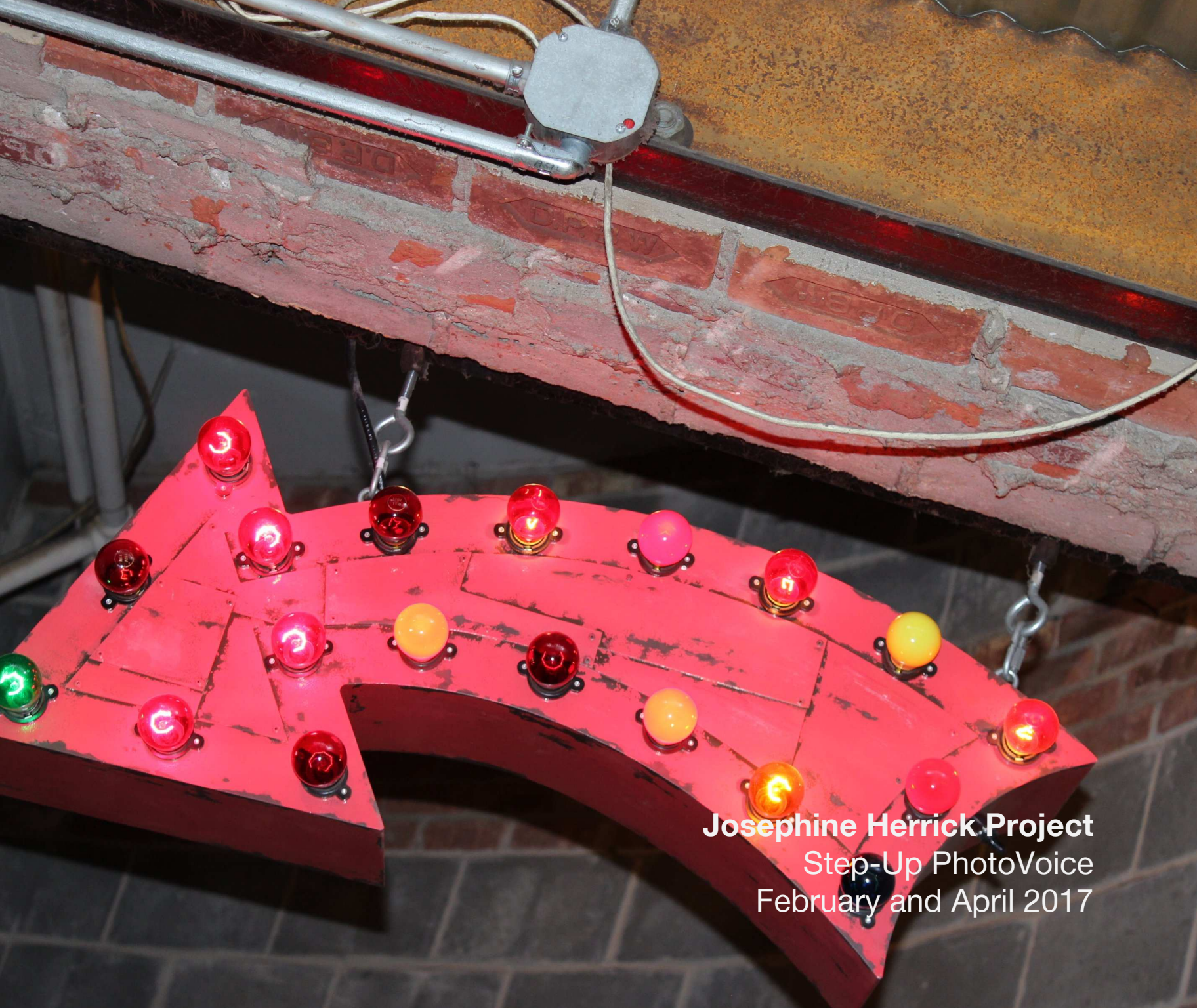
Josephine Herrick Project Step-Up PhotoVoice February and April 2017